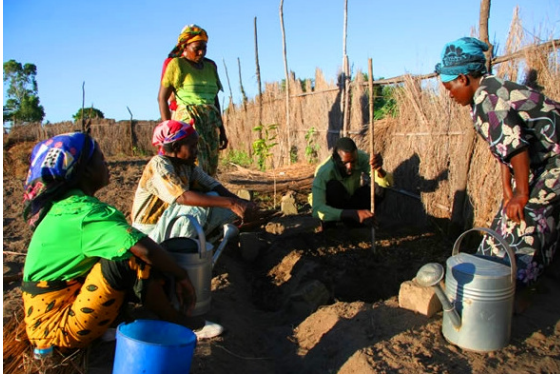
Setting up the nursery beds and using new equipment

MCESO is working in the Ruiru district of Kenya to promote community tree planting and rural reforestation through education in environmental conservation and by supporting communities to sustainably manage their natural resources in order to promote development and reduce poverty. In order to combat deforestation MCESO needed to establish a tree nursery in Murera village to provide seedlings to the village communities and promote afforestation and agro forestry methods throughout the district. NFP's funds were used to purchase tools and irrigation equipment.