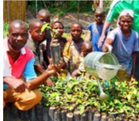
Watering seedlings with new watercans