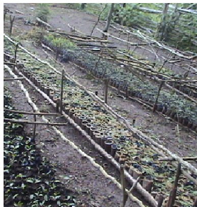
n the Kwang'ombe village nursery