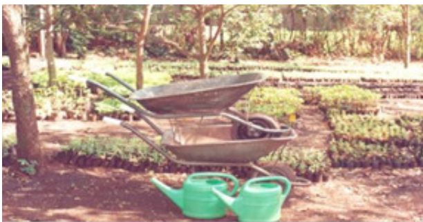
Equipment waiting to be used in one of the nurseries

The organization works in Karwemera Village, Kasese District of Uganda, to strengthen the capacity of women members and others in the community to work towards their own development. One of their projects promotes sustainable agriculture, including agroforestry. In 2010 NFP funded a workshop to train local women on the benefits of reforestation and agroforestry. This led to an increase in the area of people interested in doing agroforestry and to the establishment of tree nurseries. NFP provided funds this year to equip those nurseries in need. More specifically, NFP funds were used to purchase wheel barrows and barbed wire to protect the nurseries from animals.