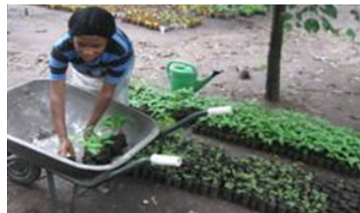
Wheelbarrow in use