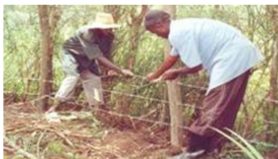
Fencing material being put to use to protect the nursery